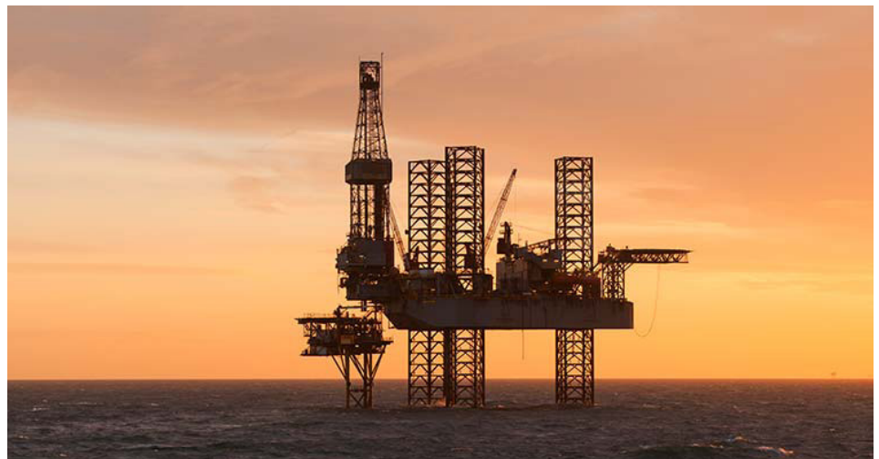
IMAGE 2: The design of the hydraulically actuated diaphragm pump is critical for pumps that are deployed on offshore platforms or in remote onshore locations.

Downstream: Refineries are enormous consumers of water. Every 50,000 barrels of refined oil generates 1 trillion British thermal units (Btu) per hour, which is removed by water evaporating in cooling towers. Large refineries can use more than 10,000 gallons per minute (gpm). As cooling towers eliminate heat from evaporating water, dissolved solids like calcium and magnesium remain in the tower. Over time, these solids diminish thermal efficiency and cause corrosion. To prevent this, API 675-compliant metering pumps are used to dose specific volumes of acids, caustics,